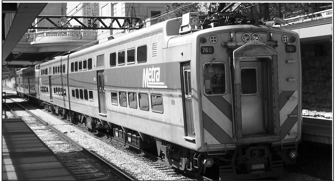
The replacement of Highliner cars on the Metra Electric District is a top priority.

A: Very big. Metra estimates it needs at least $2.6 billion over the next five years just to maintain a state of good repair. We can expect about $1.1 billion from the feds, unless President Obama and the Congress provide more in a stimulus bill. We