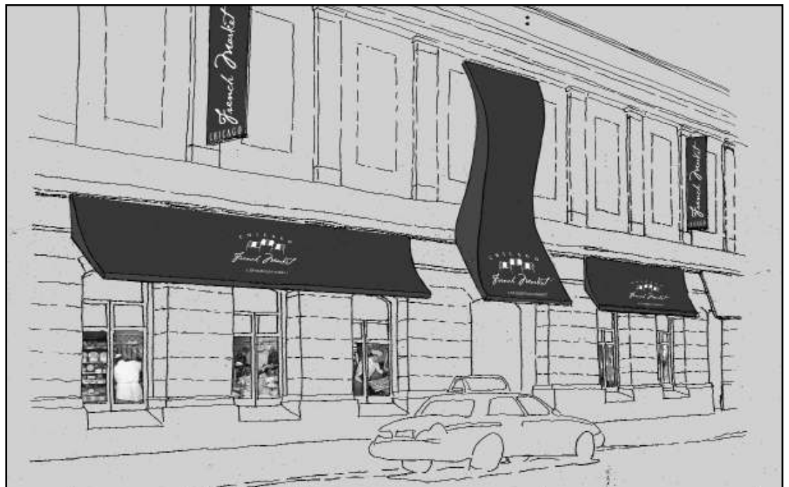
This is an artist's rendering of the Clinton Street entrance to the Chicago French Market at the Ogilvie Transportation Center.

Whether looking for a quick breakfast croissant on the way to the office, a new place to grab lunch, or shopping for