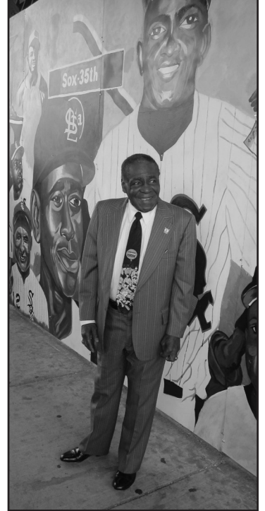
White Sox great Minnie Minoso was on hand last month for the dedication of a mural that features him as well as other notable African-American baseball players.