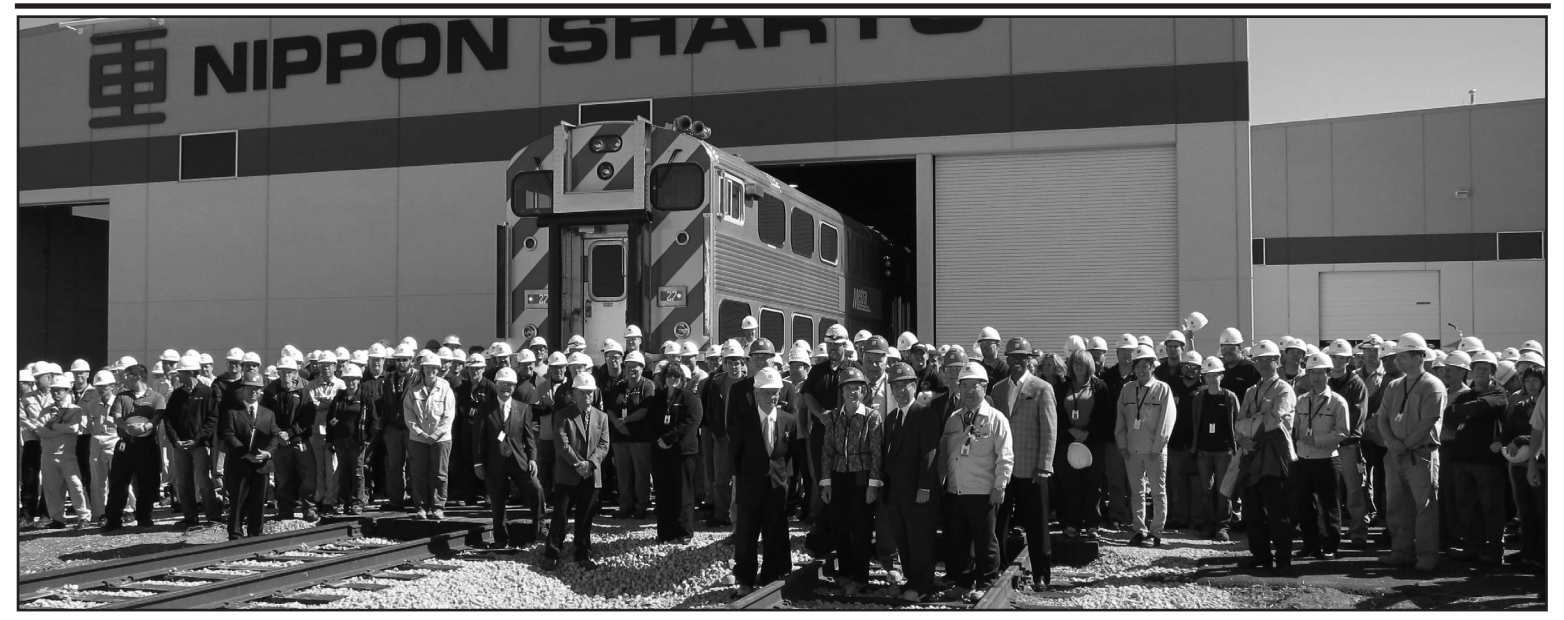
Metra, Sumitomo and Nippon Sharyo officials join workers at Nippon Sharyo's new plant in Rochelle, Ill., last month to mark the completion of the first two Metra Electric Highliner cars. The new cars could be carrying passengers as soon as November.