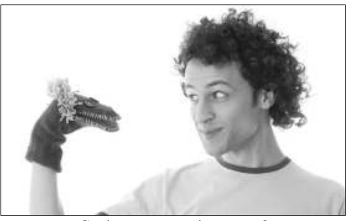
Coming soon to a train near you?

I was most puzzled by OTBL's response to Rochelle, the passenger who used music to drown out unwanted conversations. Your answer overlooked two major factors: (1) in close quarters (such as waiting in a vestibule to detrain) virtually ANY sound coming from headphones is audible; and (2) train conversations can frequently be VERY loud, as loud as anything coming from those headphones. It would seem to be that, so long as the volumes were comparable, one