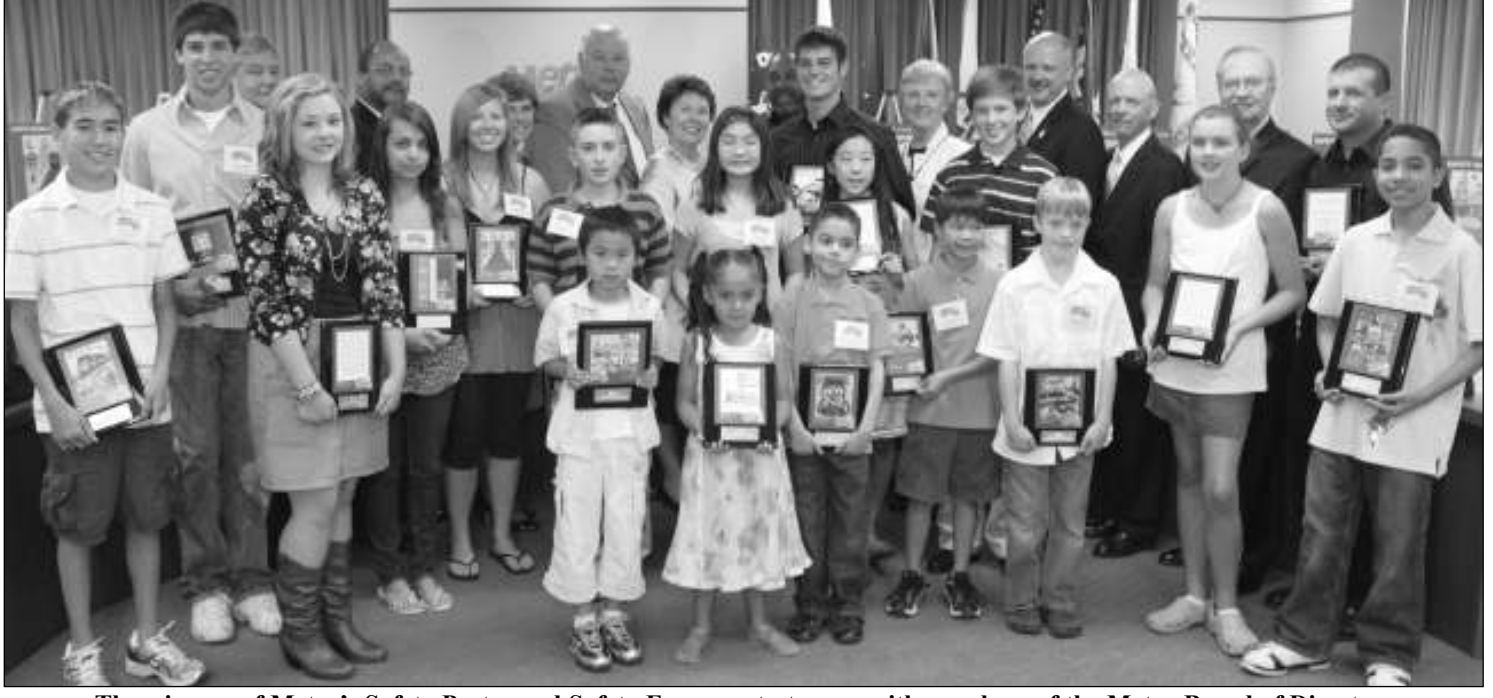
The winners of Metra's Safety Poster and Safety Essay contests pose with members of the Metra Board of Directors.