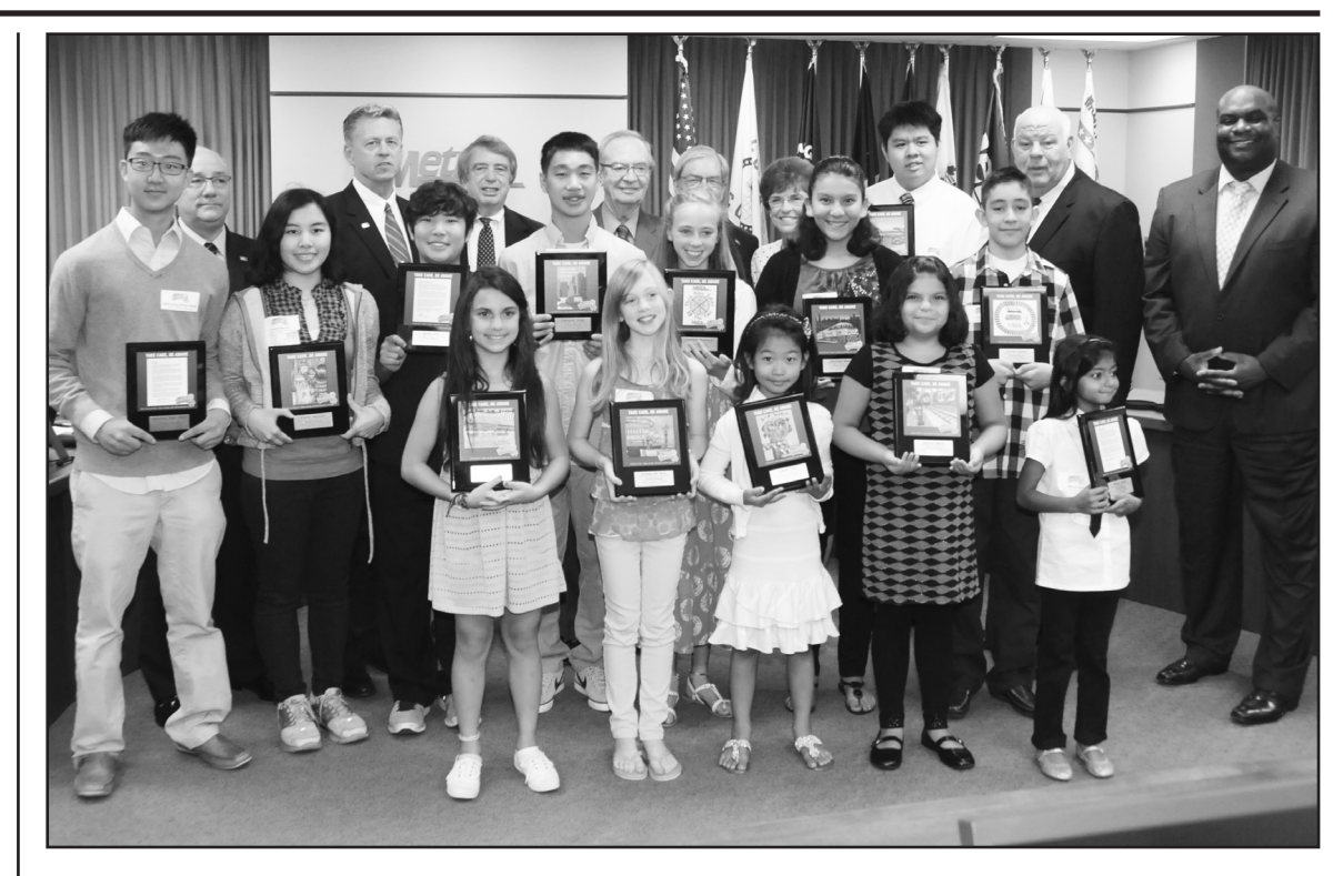
Winners of Metra's 2013 Safety Poster and Essay Contest pose with members of the Metra Board and leadership team.