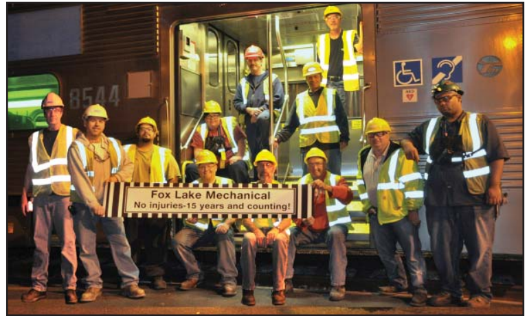
Members of Metra's Mechanical Department in Fox Lake hold a sign celebrating 15 years of injury-free work. Their amazing accomplishment reflects Metra's overriding commitment to operating safely in everything we do.

The American Heart Association wants people to experience more of life's precious moments. It's why the organization has made better heart and brain health its mission. Grab your family, friends and co-workers and join the fight at their Metro Chicago Heart Walk events. The Heart Walk is the American Heart Association's premiere event for raising funds to save lives from this country's No. 1 and No. 4 killers: heart disease and strokes. The funds you raise in